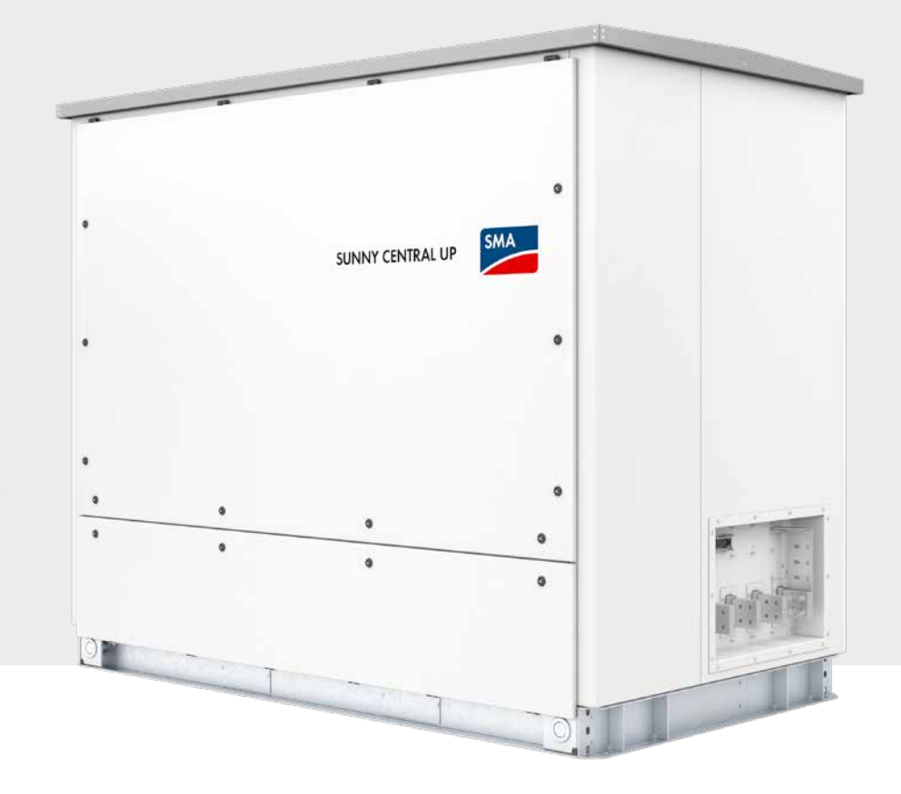
Central Inverter Sunny Central UP Power class up to 4,600 kVA

The "DC Coupling Ready" option offers the possibility of obtaining a Sunny Central central inverter with six battery inputs. This means that a battery storage system coupled on the DC side can be retrofitted easily and cost-effectively at any time – when battery prices have fallen further, for example.